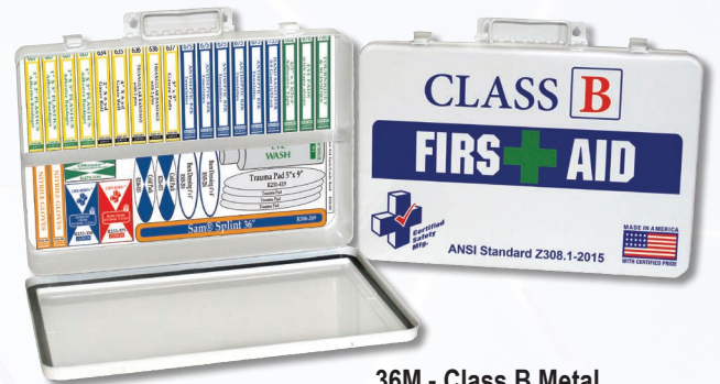
36M - Class B Metal R3# 328000061 K615-019