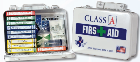
18M - Class A Metal R3# 328000041 K615-015