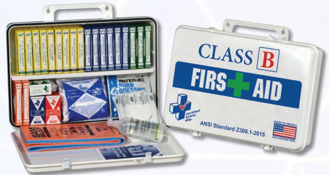
36PW - Class B Poly White R3# 328000051 K615-017

KR615-017 - Refill includes all of the items listed above