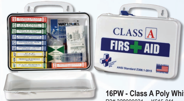
16PW - Class A Poly White R3# 328000031 K615-011

KR615-011 - Refill includes all of the items listed above